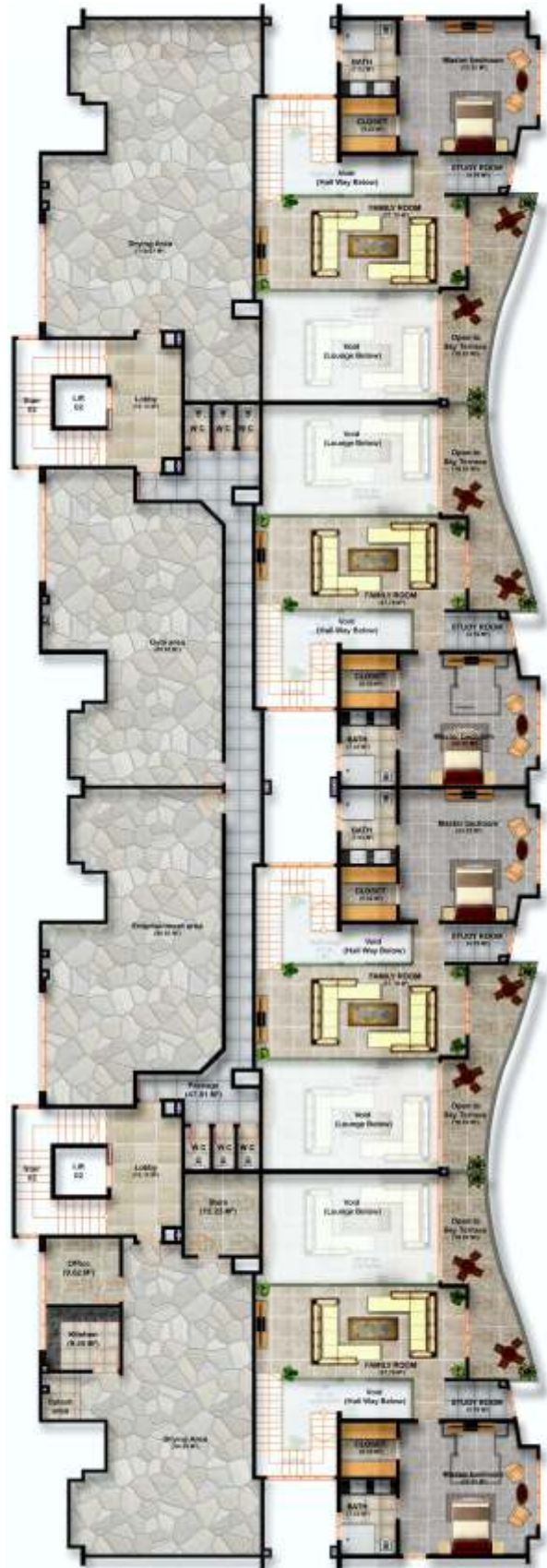
10th Floor Duplex Upper Level Plan