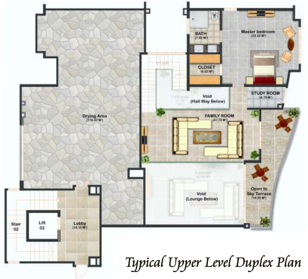
Typical Upper Level Duplex Plan