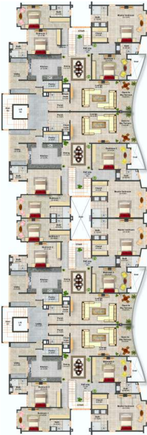
9th Floor Duplex Lower Level Plan