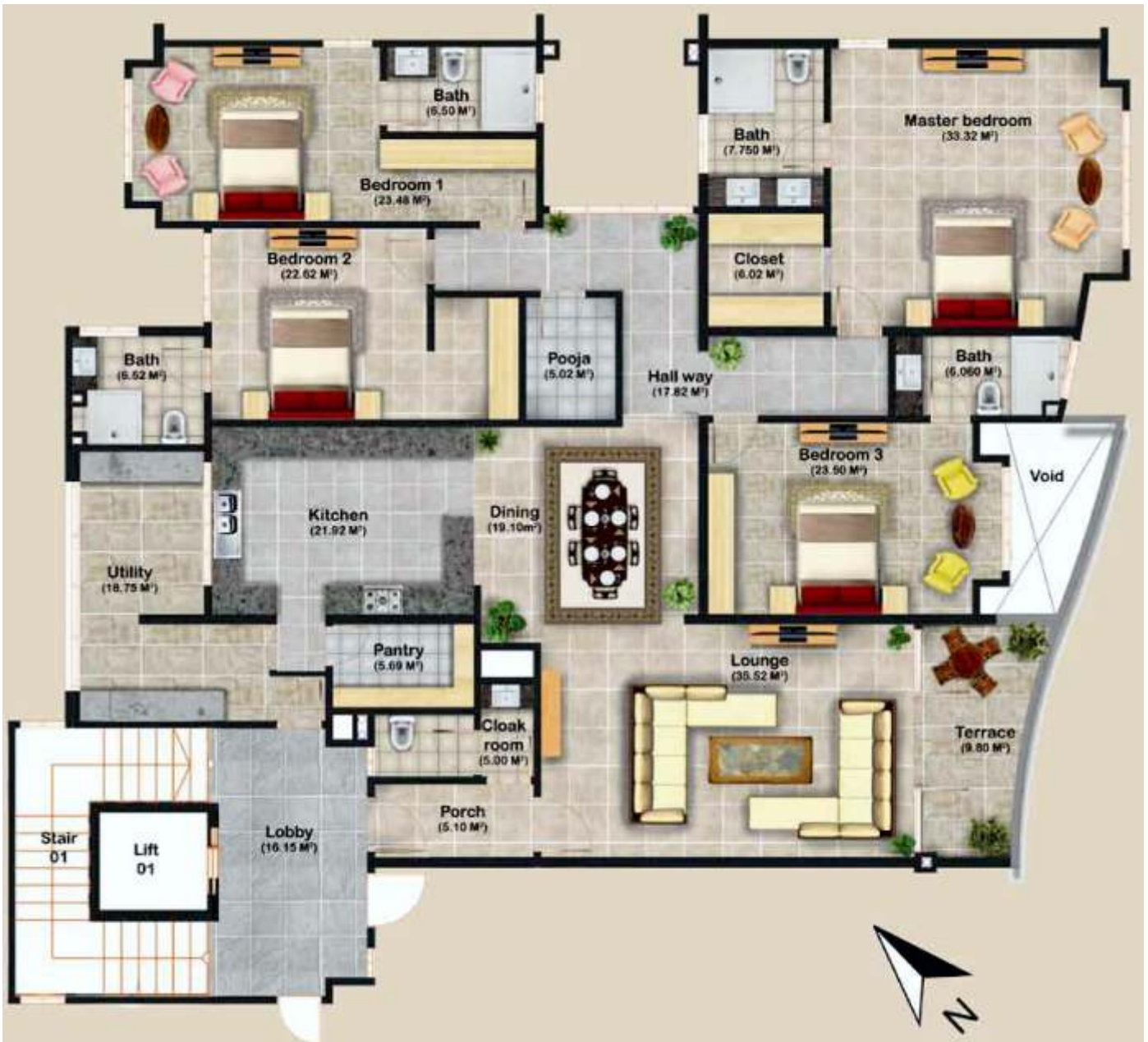
Typical Apartment Plan