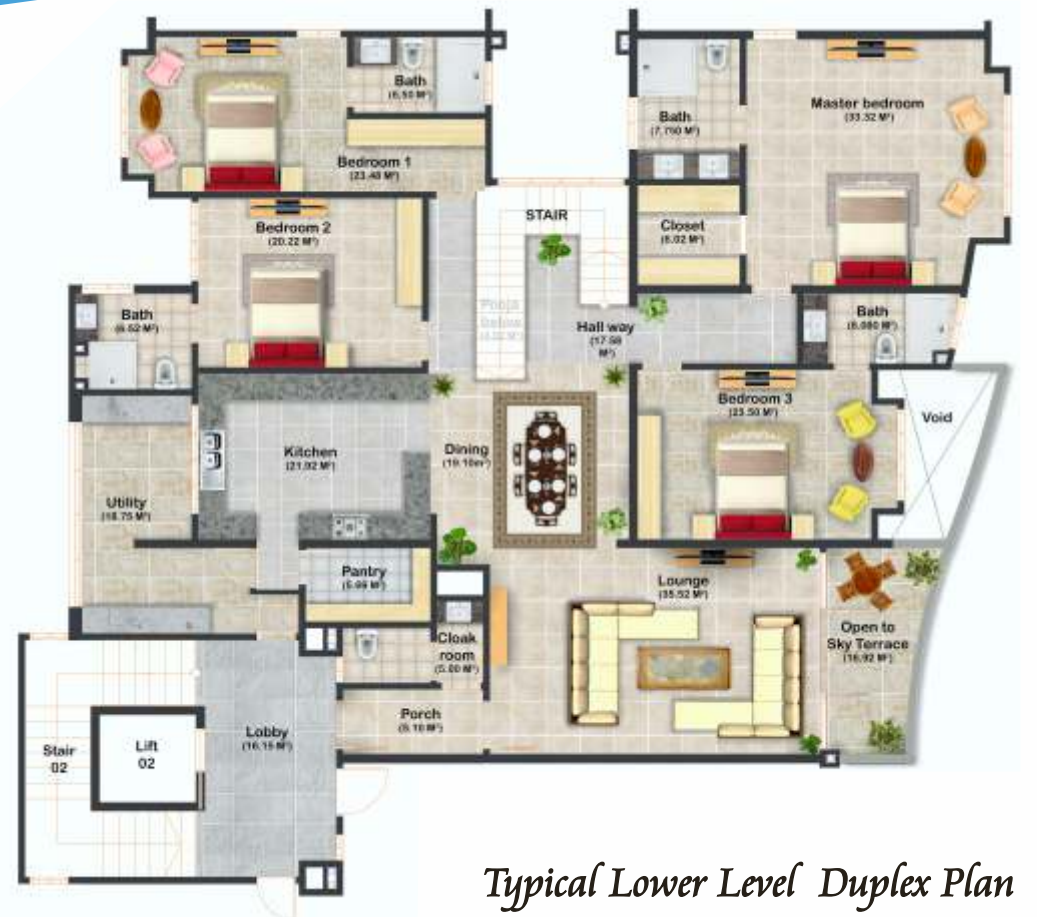
Typical Lower Level Duplex Plan